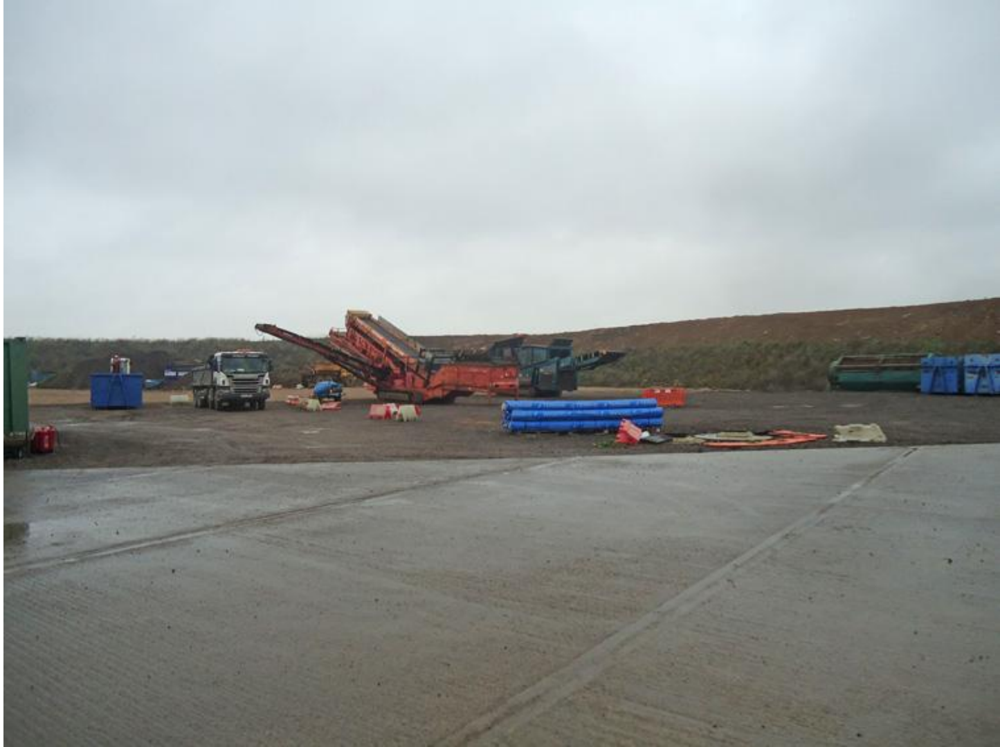
Figure 1 : Unmade surface vs existing concrete facing west (northern extract)